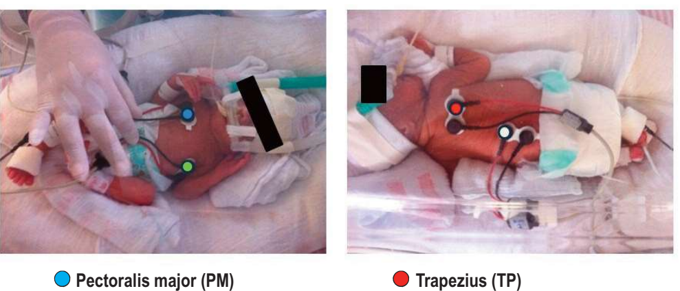
Actividad electromiográfica de los músculos respiratorios en bebés prematuros con displasia broncopulmonar: un estudio longitudinal